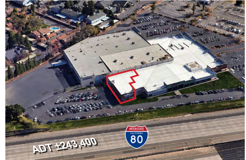
Visibility from I-80